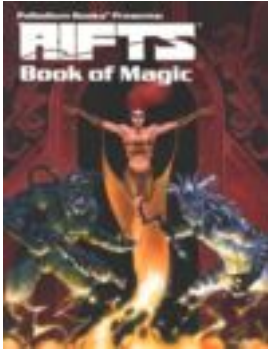
Rifts® Book of Magic™

Can you handle 660 pages of Rifts® Magic, Rifts® Adventure, Rifts® Siege, Rifts® Characters, Rifts® Weapons, Game Master tips, 101 adventure ideas