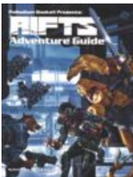
Rifts® Adventure Guide

The spell you always wanted could be inside these pages!