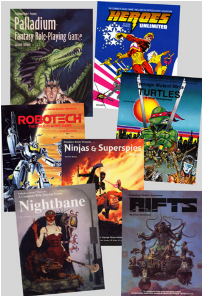
Palladium Fantasy Role-Playing Game , Heroes Unlimited , Teenage Mutant Ninja Turtles: The Complete Campaign , Robotech: The Role-Playing Game , Ninjas & Superspies , Nightbane , Rifts ® and Hollywood