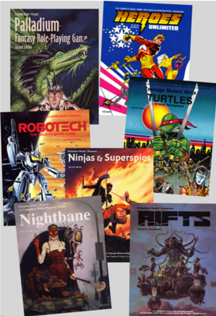
Copyright © 2014 by Palladium Books, Inc. All rights reserved. Palladium Fantasy Role-Playing Game , HEROES UNLIMITED , Teenage Mutant Ninja Turtles , ROBOTTECH , Ninjas & Superspies , Nightbane , and Rifts are trademarks of Palladium Books, Inc. All other trademarks are the property of their respective owners.