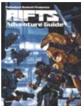
Rifts® Adventure Guide

The spell you always wanted could be inside these pages!