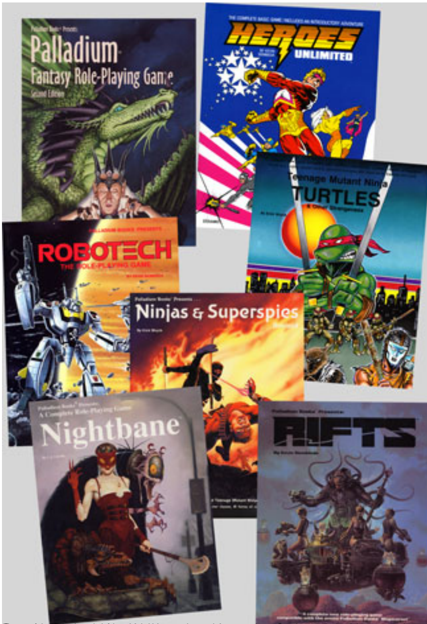
Created by the author of Rifts , Nightbane , Ninjas & Superspies , Teenage Mutant Ninja Turtles , Robotech , Heroes Unlimited , Palladium Fantasy Role-Playing Game , and Palladium Rifts and Hollywood