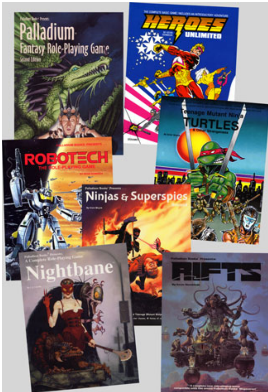
Palladium Fantasy Role-Playing Game Heroes Unlimited Teenage Mutant Ninja Turtles Robotech Ninjas & Superspies Nightbane Rifts and Hollywood