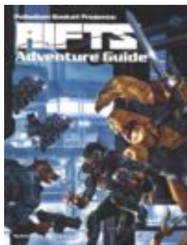
Rifts® Adventure Guide

The spell you always wanted could be inside these pages!