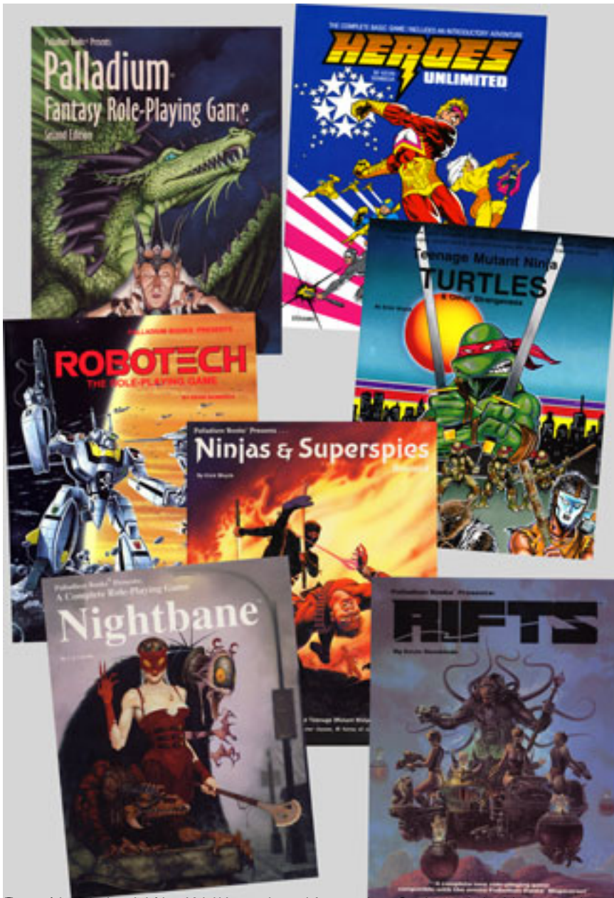
Palladium Fantasy Role-Playing Game , HEROES UNLIMITED , Teenage Mutant Ninja Turtles , ROBOTTECH THE ROLE-PLAYING GAME , Ninjas & Superspies , Nightbane , Rifts ® and Hollywood