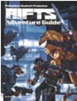
Rifts® Adventure Guide

The spell you always wanted could be inside these pages!