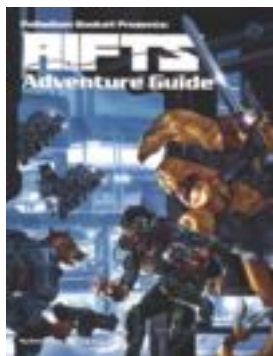
Rifts® Adventure Guide

The spell you always wanted could be inside these pages!