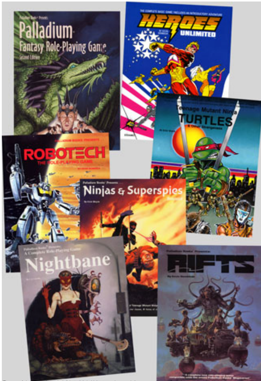
Palladium Fantasy Role-Playing Game (2nd Edition) , HEROES UNLIMITED , Teenage Mutant Ninja Turtles , ROBOTECH , Ninjas & Superspies , Nightbane , Rifts ® and Hollywood