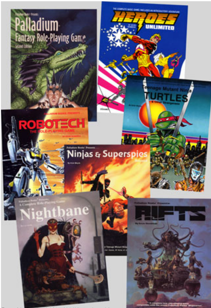
Copyright © 1999 by Palladium Books, Inc. All rights reserved. Palladium Fantasy Role-Playing Game , Heroes Unlimited , Teenage Mutant Ninja Turtles , Robotech , Ninjas & Superspies , Nightbane , and Rifts are trademarks of Palladium Books, Inc. Rifts and Hollywood are registered trademarks of Palladium Books, Inc.