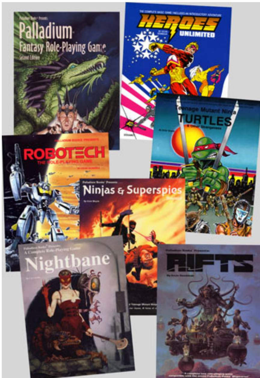
Gameplay is the most important relationship between the player and the game. The Rifts® and Hollywood