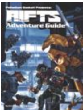
Rifts® Adventure Guide

The spell you always wanted could be inside these pages!