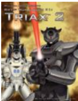
Rifts® Triax™ 2

World Books are big, juicy sourcebooks centered around specific places, cities and people of the world. Each offers information on the cultures, technology, monsters, villains and dangers of the region. Most include new Occupational Character Classes (O.C.C.s), alien races (R.C.C.s), monsters, weapons, equipment, and/or magic, as well as adventure ideas. Each typically ranges in size from 160-224 pages. See Palladium's online catalog for details.