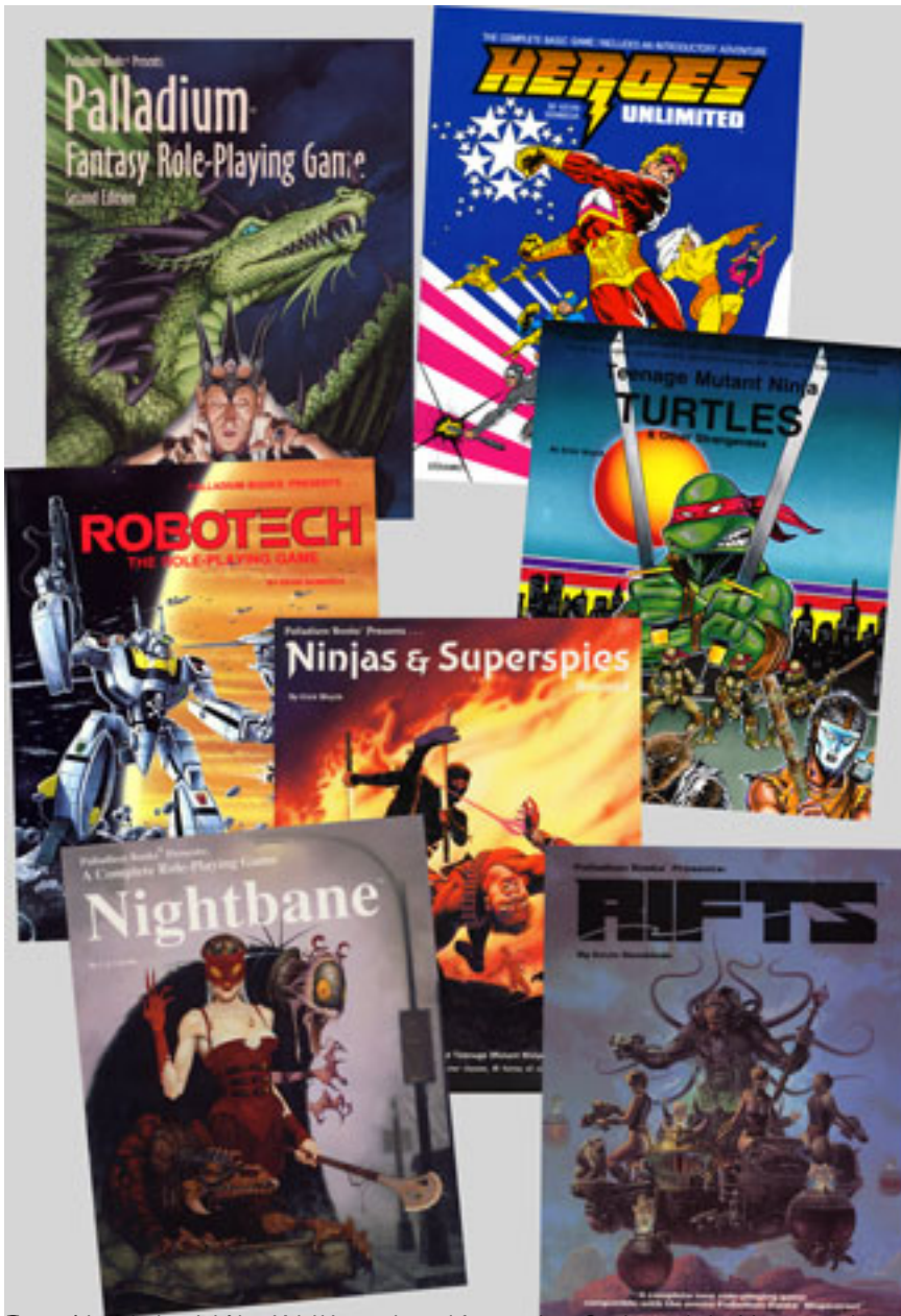
Copyright © 1997 by Palladium Books, Inc. All rights reserved. Palladium Fantasy Role-Playing Game , HEROES UNLIMITED , Teenage Mutant Ninja Turtles , ROBOTTECH THE ROLE-PLAYING GAME , Ninjas & Superspies , Nightbane , and RIFTS are trademarks of Palladium Books, Inc. Palladium Fantasy Role-Playing Game , HEROES UNLIMITED , Teenage Mutant Ninja Turtles , ROBOTTECH THE ROLE-PLAYING GAME , Ninjas & Superspies , Nightbane , and RIFTS are registered trademarks of Palladium Books, Inc. Palladium Fantasy Role-Playing Game , HEROES UNLIMITED , Teenage Mutant Ninja Turtles , ROBOTTECH THE ROLE-PLAYING GAME , Ninjas & Superspies , Nightbane , and RIFTS are registered trademarks of Palladium Books, Inc. Palladium Fantasy Role-Playing Game , HEROES UNLIMITED , Teenage Mutant Ninja Turtles , ROBOTTECH THE ROLE-PLAYING GAME , Ninjas & Superspies , Nightbane , and RIFTS are registered trademarks of Palladium Books, Inc.