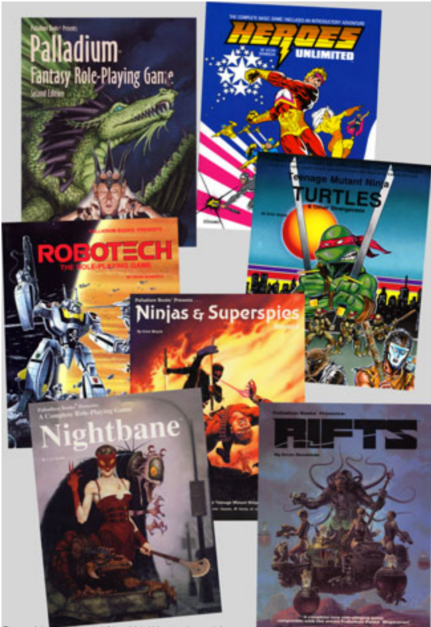
Gameplay is the mainstay of the Rifts® and Hollywood Ninjas™ and Superheroes™