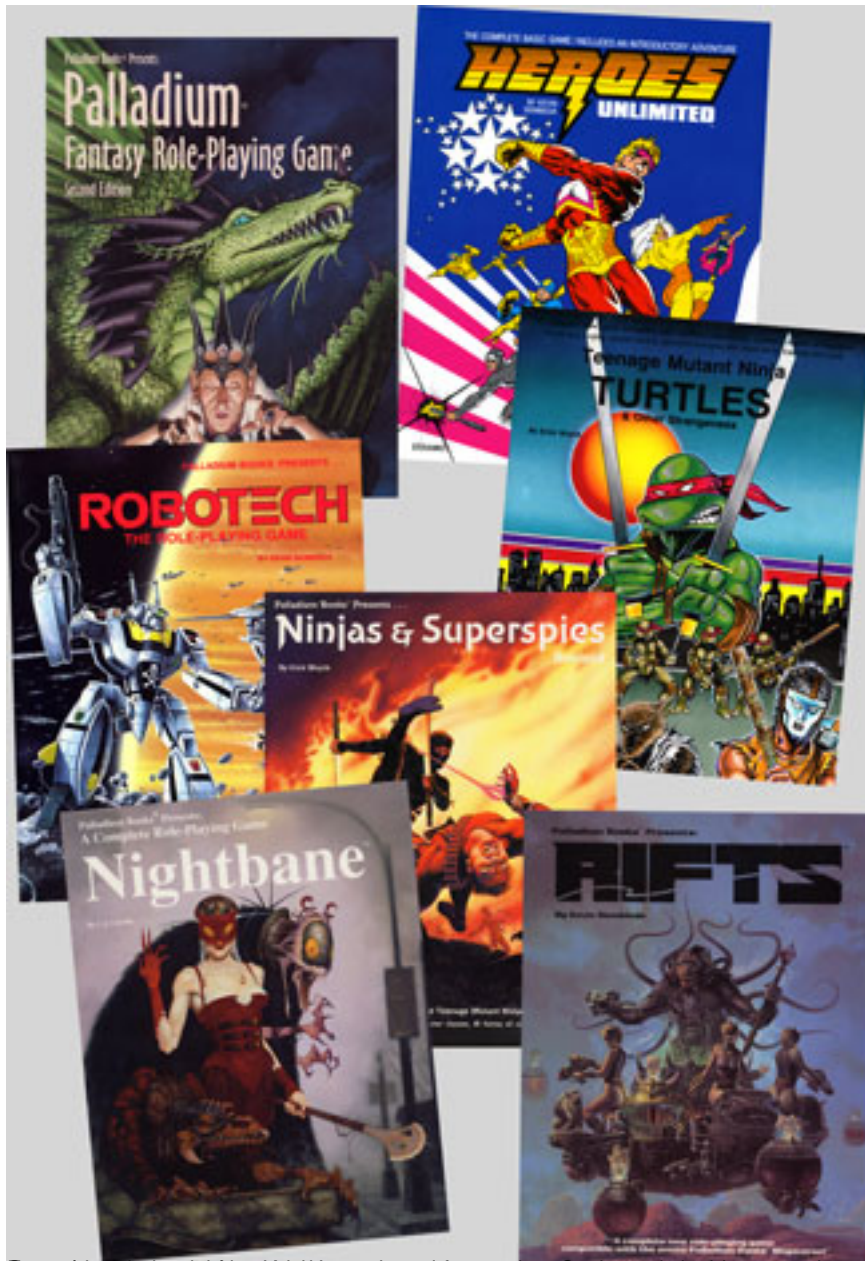
Creating the worlds of Rifts , Ninjas & Superspies , Nightbane , Heroes Unlimited , Teenage Mutant Ninja Turtles , Robotech , and Palladium Fantasy Role-Playing Game .