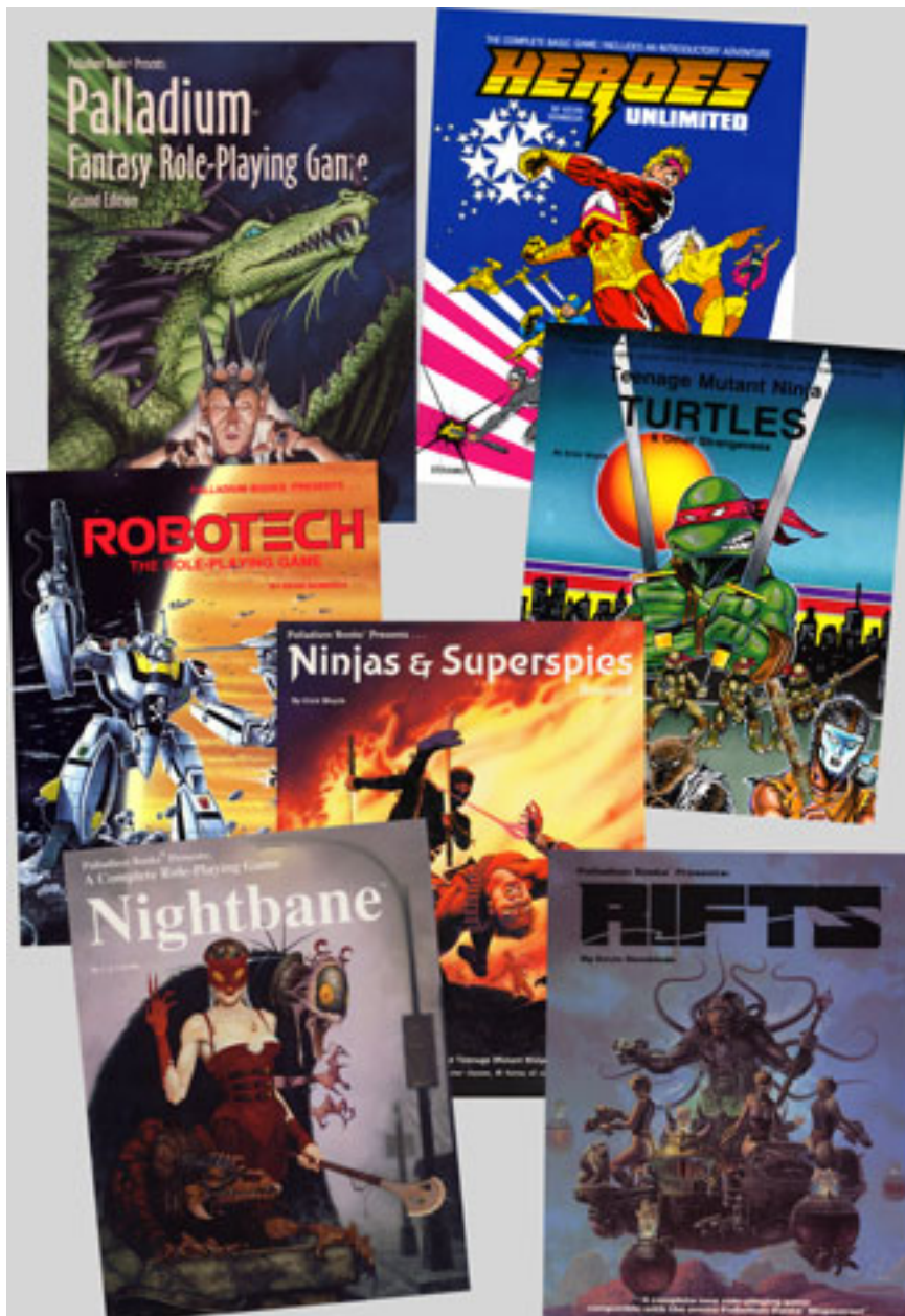
Creating the worlds of Rifts , Nightbane , Ninjas & Superspies , Teenage Mutant Ninja Turtles , Heroes Unlimited , Robotech , and Palladium Fantasy Role-Playing Game