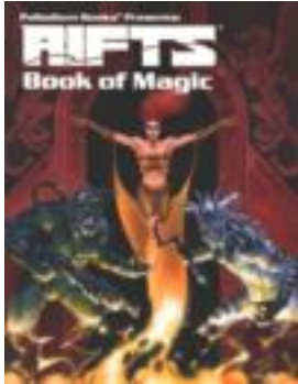
Rifts® Book of Magic™

Can you handle 660 pages of Rifts® Magic, Rifts® Adventure, Rifts® Siege, Rifts® Characters, Rifts® O.C.C.s, Rifts® Weapons, Game Master tips, 101 adventure ideas