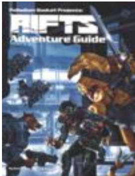
Rifts® Adventure Guide

The spell you always wanted could be inside these pages!