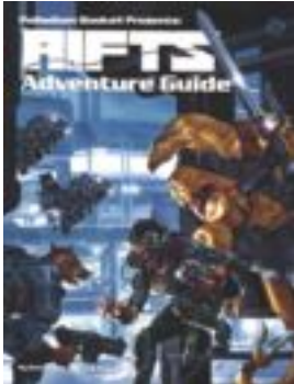
Rifts® Adventure Guide

The spell you always wanted could be inside these pages!