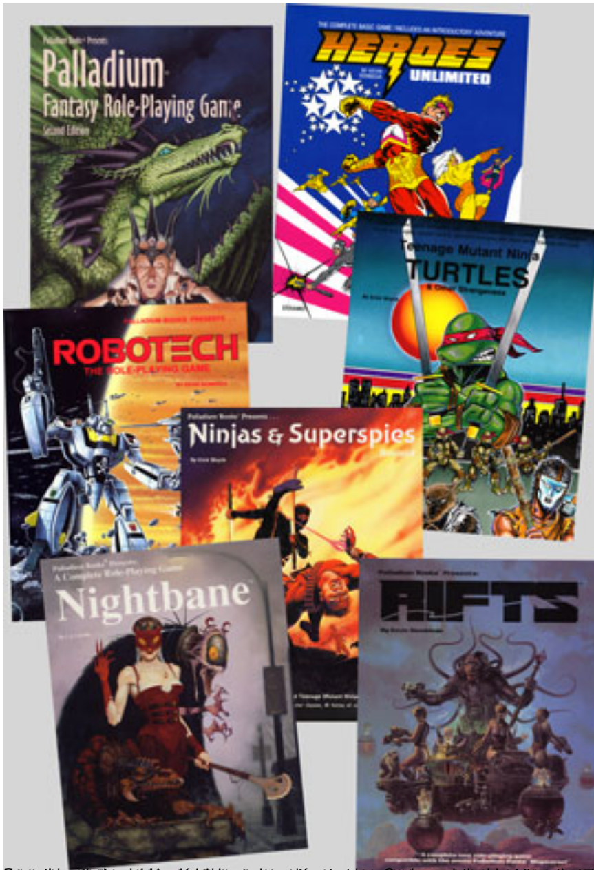
Created by the author of Rifts , Heroes Unlimited , Nightbane , Ninjas & Superspies , Teenage Mutant Ninja Turtles , Robotech , and Palladium Fantasy Role-Playing Game . Rifts ® and Hollywood