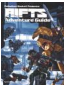
Rifts® Adventure Guide

The spell you always wanted could be inside these pages!