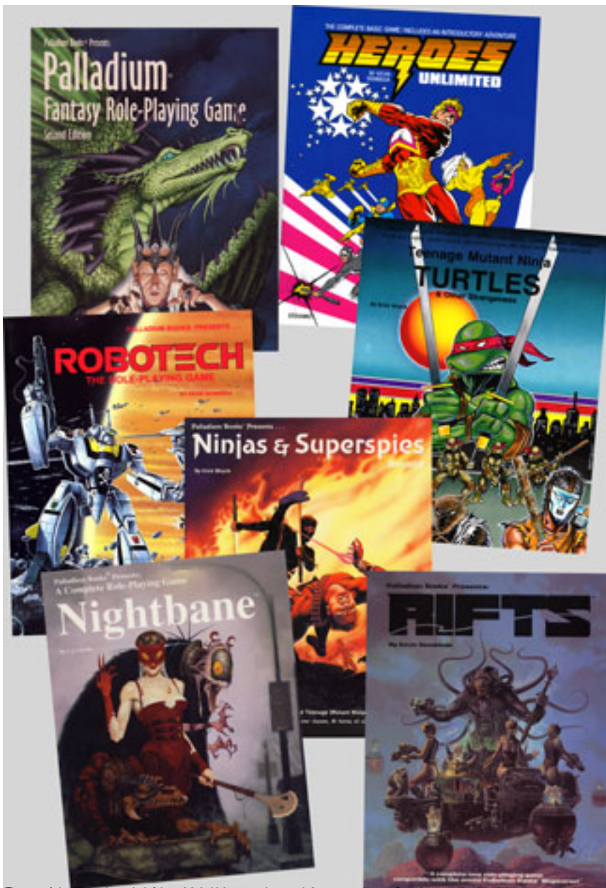
Palladium Fantasy Role-Playing Game Heroes Unlimited Teenage Mutant Ninja Turtles Robotech Ninjas & Superspies Nightbane Rifts and Rifts