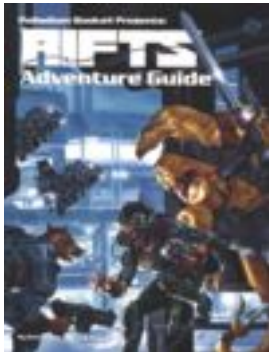
Rifts® Adventure Guide

The spell you always wanted could be inside these pages!