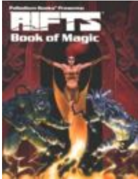
Rifts® Book of Magic™

Can you handle 660 pages of Rifts® Magic, Rifts® Adventure, Rifts® Siege, Rifts® Characters, Rifts® Collections, Game Master tips, 101 adventure ideas