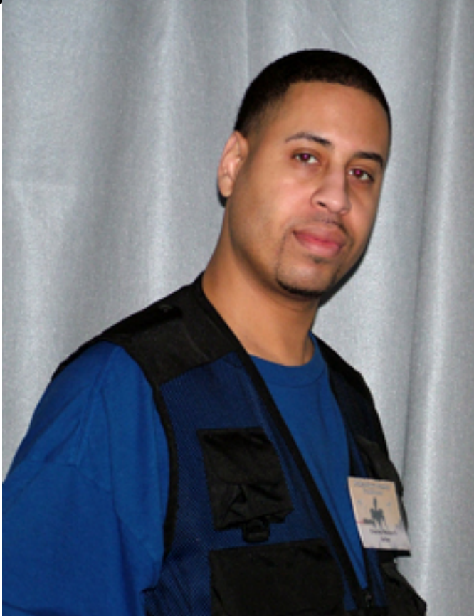
Portrait of Ramon Perez, a man with short dark hair, wearing a blue shirt and a black vest, standing against a light blue background. Photo by Ramon Perez. www.ramonperez.com Portrait of Ramon Perez, a man with short dark hair, wearing a blue shirt and a black vest, standing against a light blue background. Photo by Ramon Perez. www.ramonperez.com