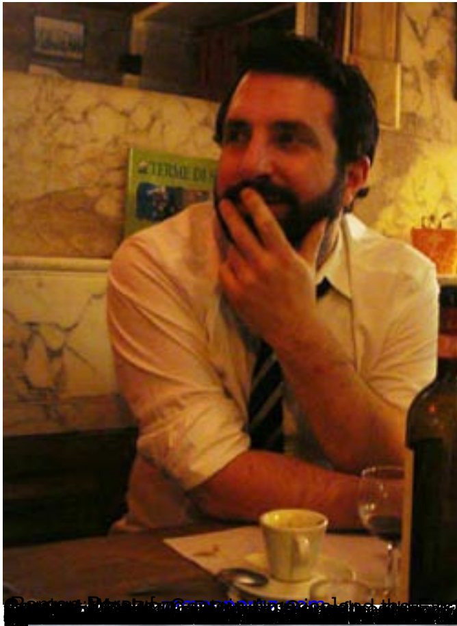
Portrait of Ramon Perez, a man with a beard and mustache, wearing a white shirt and tie, sitting at a table with a cup and saucer, looking thoughtful. Photo by Ramon Perez. www.ramonperez.com Portrait of Ramon Perez, a man with a beard and mustache, wearing a white shirt and tie, sitting at a table with a cup and saucer, looking thoughtful. Photo by Ramon Perez. www.ramonperez.com