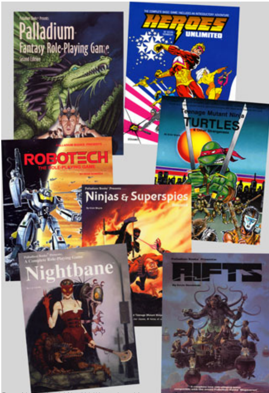
Copyright © 1997 by Palladium Books, Inc. All rights reserved. Palladium Fantasy Role-Playing Game , HEROES UNLIMITED , Teenage Mutant Ninja Turtles , ROBOTTECH THE ROLE-PLAYING GAME , Ninjas & Superspies , Nightbane , and RIFTS are trademarks of Palladium Books, Inc. Palladium Fantasy Role-Playing Game , HEROES UNLIMITED , Teenage Mutant Ninja Turtles , ROBOTTECH THE ROLE-PLAYING GAME , Ninjas & Superspies , Nightbane , and RIFTS are registered trademarks of Palladium Books, Inc.