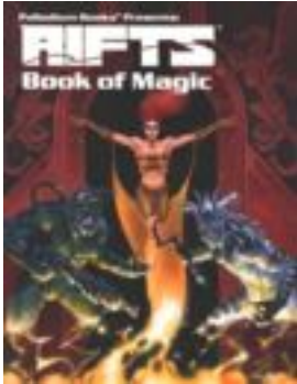
Rifts® Book of Magic™

Can you handle 660 pages of Rifts® Magic, Rifts® Adventure, Rifts® Siege, Rifts® Characters, Rifts® Collections, Game Master tips, 101 adventure ideas