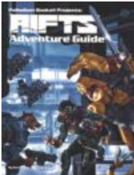
Rifts® Adventure Guide

The spell you always wanted could be inside these pages!