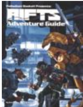
Rifts® Adventure Guide

The spell you always wanted could be inside these pages!