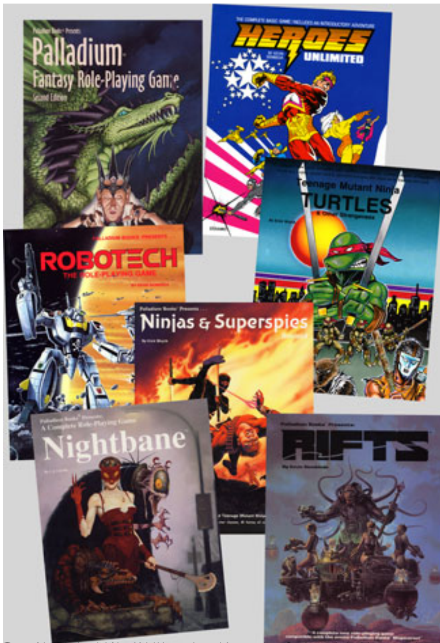
Created by the author of Rifts , Heroes Unlimited , Ninjas & Superspies , Nightbane , Rifts and Teenage Mutant Ninja Turtles . Rifts® and Hollywood