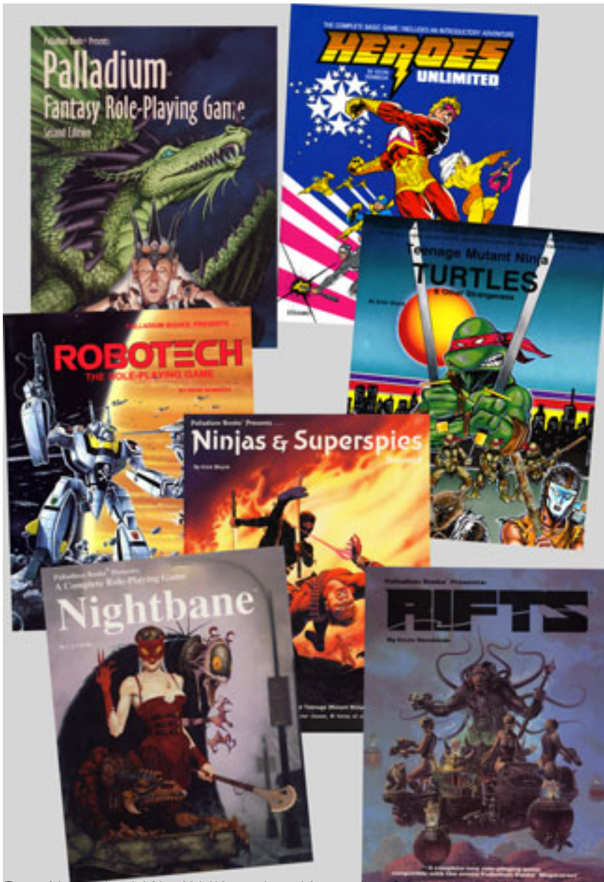
Gameplay is the main focus of the Rifts® and Hollywood Ninjas™ and Superspies™. The Rifts® and Hollywood Ninjas™ and Superspies™ are the most popular role-playing games in the world.