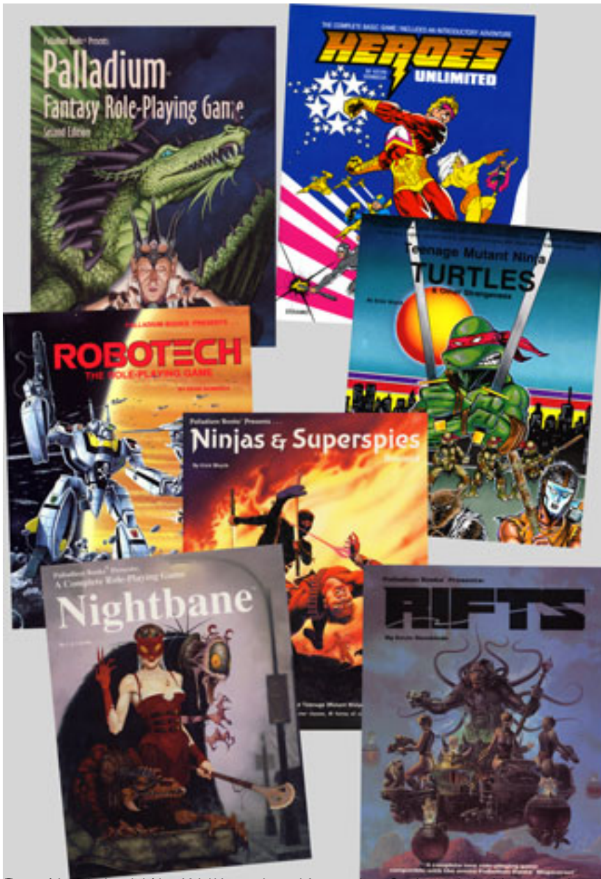
Created by the author of Rifts , the book Heroes Unlimited is a Palladium RPG book for the Palladium System of Role Playing Games and is a part of the Palladium Books and Games series . Rifts ® and Hollywood